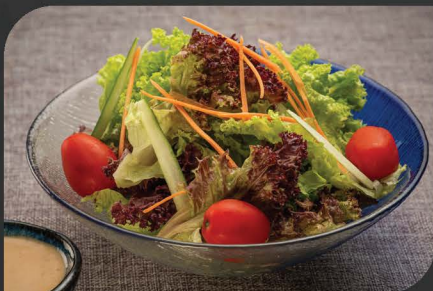
MIDORI SARADA $6.50 Garden Green salad