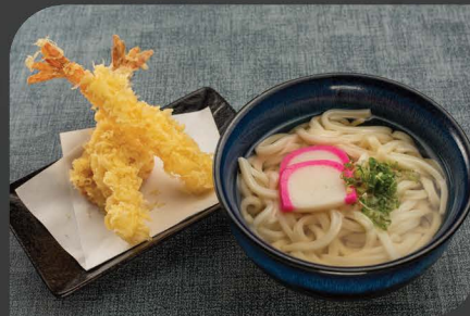
N143 TEMPURA UDON $11.90 Crispy batter fried prawns & vegetables with hot soup noodles