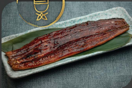
UNAGI KABAYAKI $24.50 Grilled eel with sweet savoury soy sauce