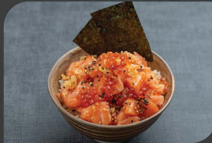
SAKE IKURA DON $12.90 Raw salmon slices with salmon roe on furikake sushi rice