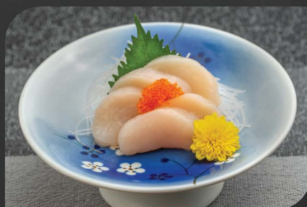
NAMA HOTATE SASHIMI Raw scallop