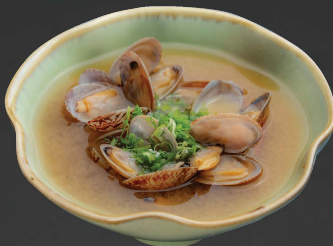
W160 ASARI MISOSHIRU $9.90 Clams miso soup