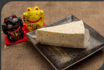
HOKKAIDO EARL GREY CHEESE CAKE $5.90