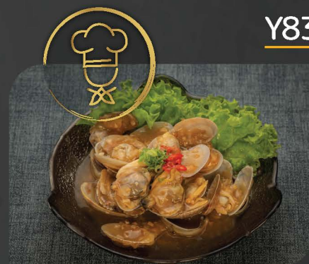
ASARI BATA-SHOYU (SPICY) $12.90 Stir-fried clams with spicy soy butter sauce