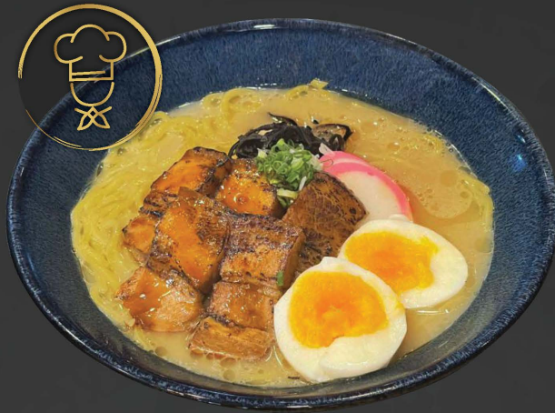
N148 BUTA KAKUNI RAMEN $15.90 Braised pork with in house soy blend with ramen Choice of soup base: Pork Base/Spicy Base