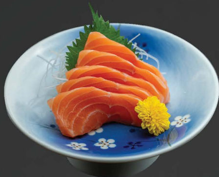
SSM26 SAKE SASHIMI $8.90 Raw salmon slices