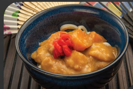
N146 TORI KARE UDON $9.90 Thick wheat flour noodles with home-made chicken curry sauce