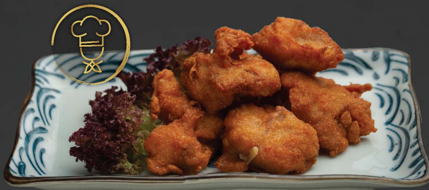
A66 TORI KARA-AGE Deep-fried bite-size chicken