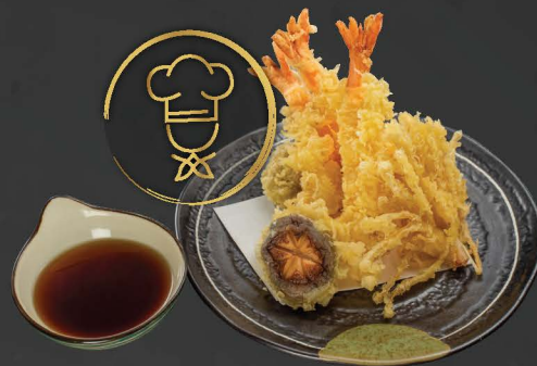
A61 TEMPURA MORIWASE $10.90 Crispy batter fried prawns & vegetables