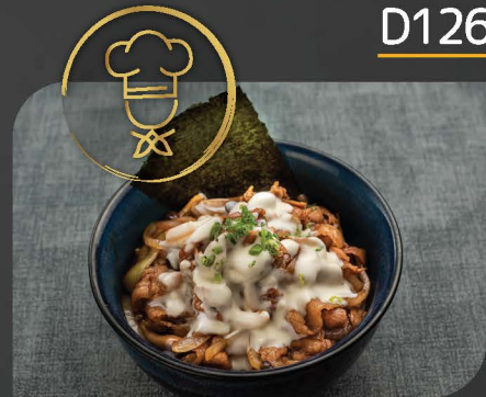
D126 YUKI BUTA DON $13.90 Stir-fried chestnut-pork belly slices with shrooms on rice, cheezy sauce