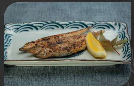
SHISHAMO $5.90 Smelt fish