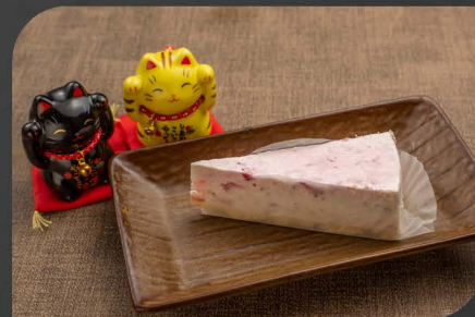
HOKKAIDO STRAWBERRY CHEESE CAKE $5.90