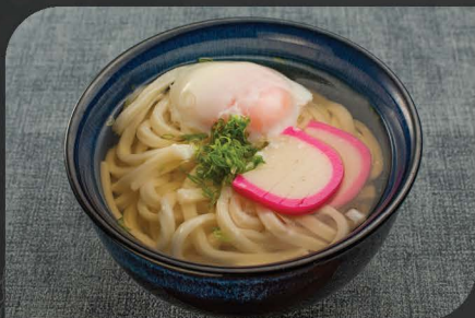
N145 TSUKIMI UDON $7.50 Onsen egg with hot soup noodles