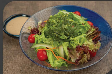
WAKAME SARADA $8.50 Seasoned seaweed salad