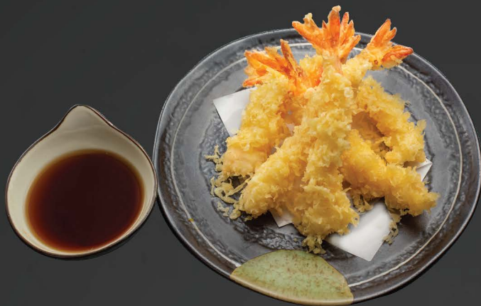
A60 EBI TEMPURA $10.90 Crispy batter fried prawns