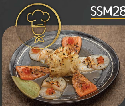
SSM28 SAKE HOTATE YUZU TRUFFLE CARPACCIO $14.90 Thinly sliced salmon & scallop with citrus soy sauce