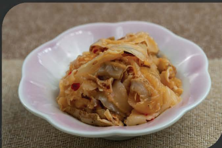
Z05 CHUKA HOTATE $6.50 Seasoned scallop rim