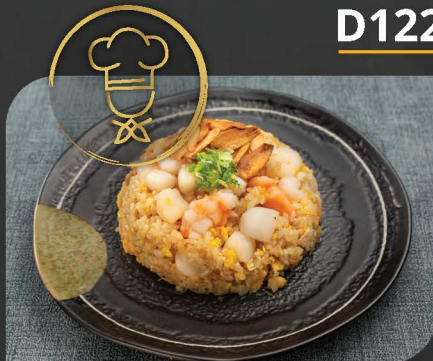
D122 KAISEN CHAHAN $12.50 Fried garlic rice with seafood