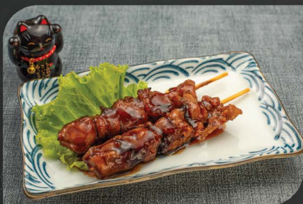
YAKITORI $6.50 Tare-Glazed grilled chicken skewers