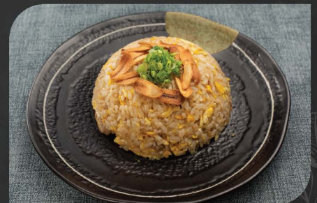
D123 TORI CHAHAN $9.50 Fried garlic rice with chicken