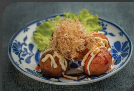
TAKOYAKI $4.90 Octopus Ball