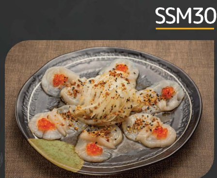
SSM30 NAMA HOTATE YUZU TRUFFLE CARPACCIO 15.90 Thinly sliced scallop with citrus soy sauce