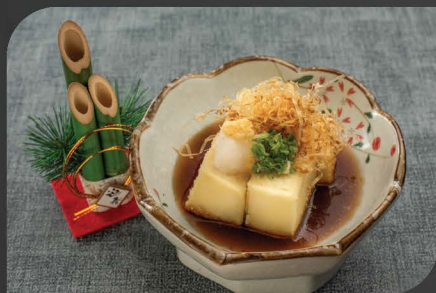
AGEDASHI TOFU $4.90 Deep-fried tofu with bonito flakes