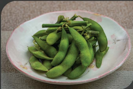
Z03 EDAMAME $4.90 Immature soybeans