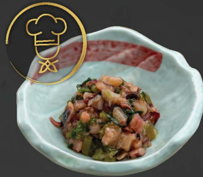
Z02 TAKOWASA $6.50 Wasabi flavored cooked octopus