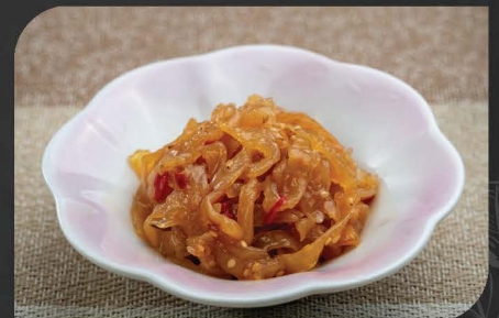
Z07 CHUKA KURAGE $6.50 Seasoned sesame jellyfish