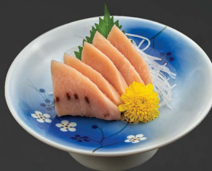
SSM27 MEKAJIKI SASHIMI $11.90 Raw swordfish slices