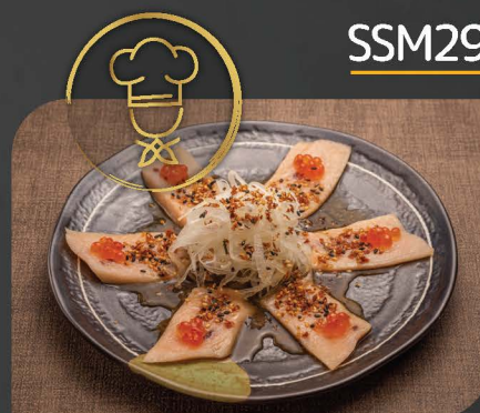
SSM29 MEKAJIKI YUZU TRUFFLE CARPACCIO $14.90 Thinly sliced swordfish with citrus soy sauce