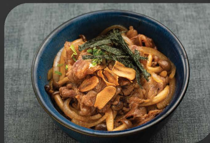
D128 GYUNIKU DON $11.90 Stir-fried beef slices with shrooms on rice