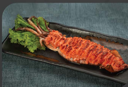
IKA MENTAI MAYO/MISO MAYO $14.90 Grilled Squid with pollock roe mayonnaise, miso mayonnaise