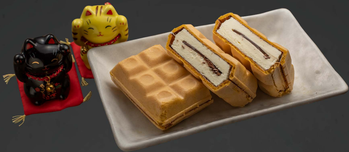
D170 CHOCOLATE WAFER