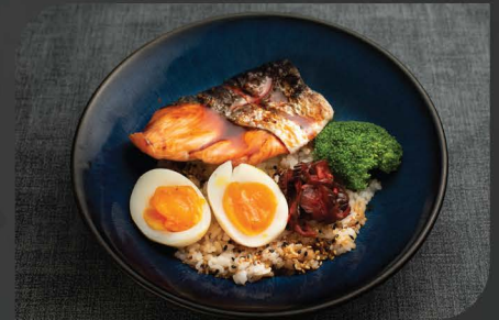
SAKE TERIYAKI DON $12.90 Glazed grilled salmon fillet on furikake rice