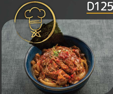
D125 KARAI GYU DON $13.90 Stir-fried beef slices with shrooms on rice, spicy sauce