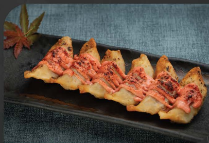
MENTAI GYOZA $6.90 Deep-fried meat dumplings with pollock roe mayo sauce