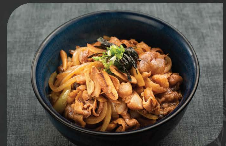
D129 KURI BUTA BELLY DON $11.90 Stir-fried chestnut-pork belly slices with shrooms on rice