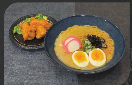
N153 TORI KARA-AGE RAMEN $13.90 *Deep-fried bite-size marinated chicken with Ramen Choice of soup base: Pork Base/Spicy Base