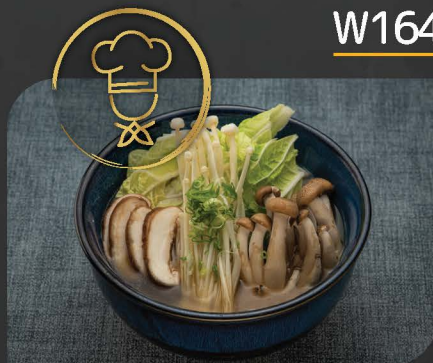
YASAI MISOSHIRU $6.90 Mix vegetables miso soup