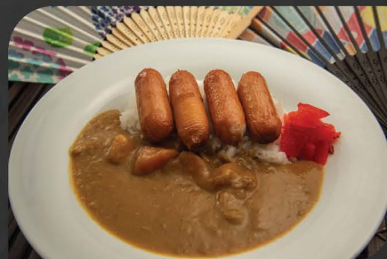
VIENNA SOSEJI KARE $8.90 Vienna Sausages with curry rice