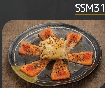
SSM31 SAKE YUZU TRUFFLE CARPACCIO $11.90 Thinly sliced salmon with citrus soy sauce