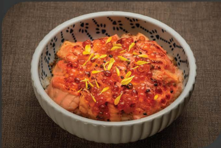
ABURI SAKE MENTAI DON $14.90 Raw salmon slices with flame seared pollock roe mayoniase on furikake sushi rice