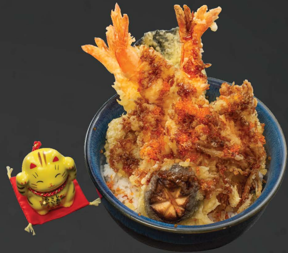
D124 TENDON $12.90 Crispy batter fried prawns & vegetables on rice, sweet & tangy soy sauce