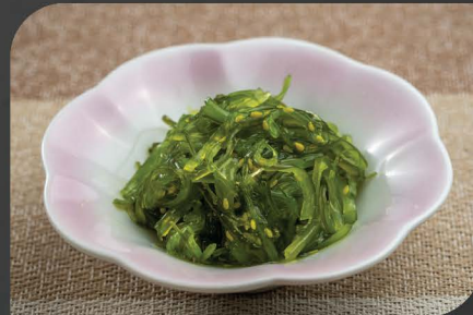
Z04 CHUKA WAKAME $5.50 Seasoned sesame seaweed