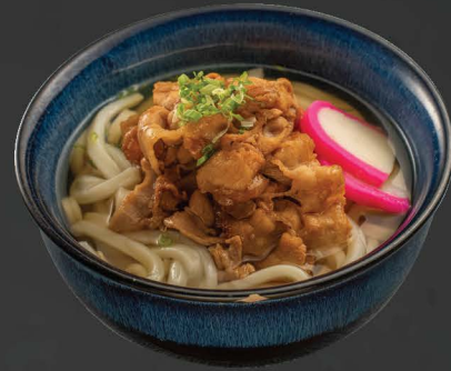
N141 KURI BUTA BELLY/GYUNIKU UDON $13.90 Chestnut-pork / beef slices with hot soup noodles