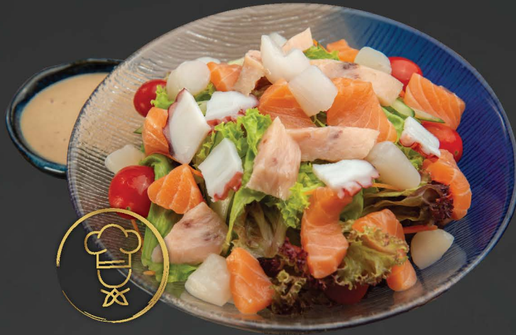
S11 MIXED SASHIMI SARADA $12.90 Assorted raw fish, scallops & octopus salad