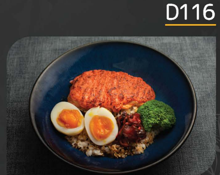
SAKE MENTAI MAYO DON $14.90 Grilled salmon fillet with pollock roe on furikake rice