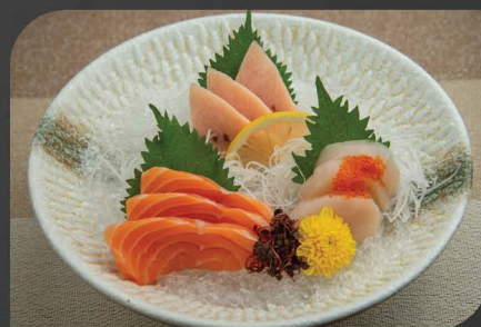
AJISAI SASHIMI MORIWASE $18.90 3 kinds - Salmon, swordfish, raw scallop