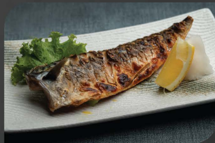
SABA SHIO/TERIYAKI $8.90 Grilled Mackerel (Salted/Glazed)