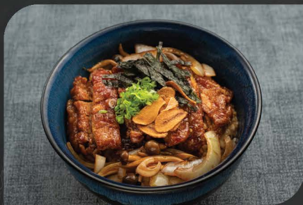
D127 TORI TERIYAKI DON $9.90 Glazed Pan-fried chicken with shrooms on furikake rice