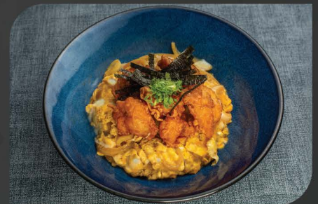
D120 TORI AGE TAMA DON $9.90 Deep-fried chicken chunks on furikake rice