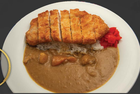
C101 KURI BUTA/TORI KATSU KARE $15.90/$12.90 Deep-fried panko breaded chestnut-pork/chicken cutlet with curry rice