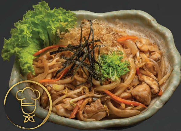
N140 TORI YAKI UDON $10.90 Stir fried Japanese thick noodles with chicken & vegetables