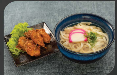
N144 TORI KARA-AGE UDON $11.90 Deep-fried bite-size marinated chicken with hot soup noodles