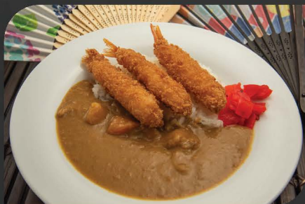
EBI FURAI KARE $10.90 Deep-fried panko breaded prawns with curry rice