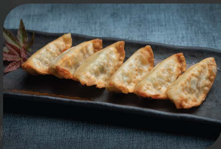
GYOZA $5.90 Deep-fried meat dumplings