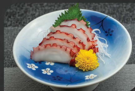
TAKO SASHIMI boiled cold octopus