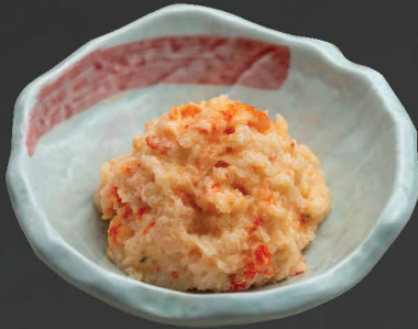
Z01 ISEBI SARADA $6.90 Lobster salad