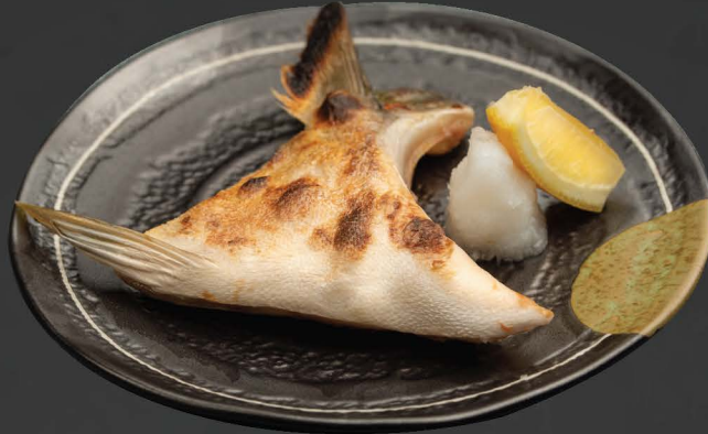
Y87 HAMACHI KAMA SHIOYAKI $15.90 Grilled yellowtail collar with salt