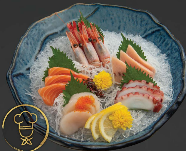
SSM20 NEMOFIRA SASHIMI MORIWASE $30.90 5 kinds - Salmon, swordfish, tako, sweet shrimp, raw scallop