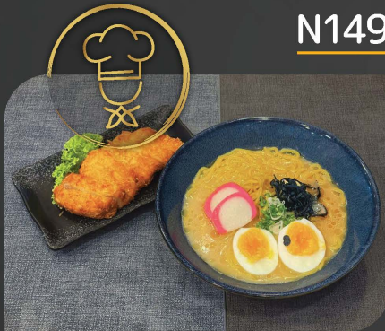
N149 KURI BUTA $17.90 TORI KATSU RAMEN $14.90 Deep-fried Chestnut Pork/Chicken with Ramen Choice of soup base: Pork Base/Spicy Base