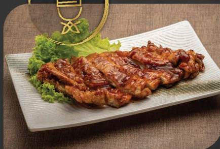
TORI TERIYAKI $8.90 Glazed pan-fried chicken