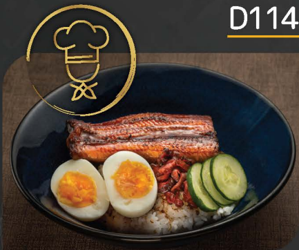
UNAGI DON $16.90 Grilled eel with sweet savoury soy sauce on furikake rice