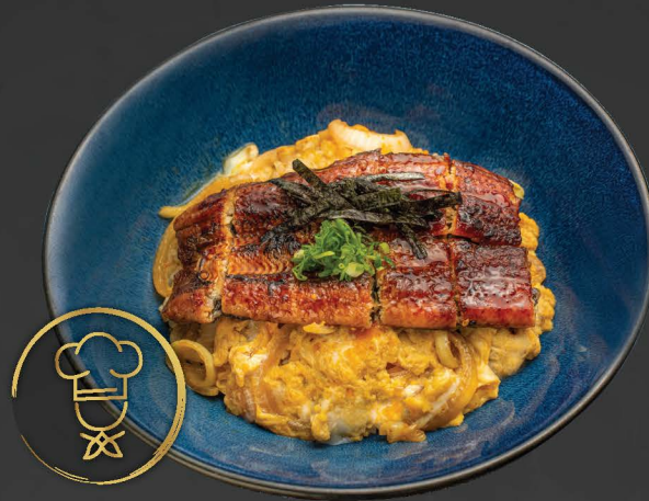
D117 UNA TAMAGO DON $16.90 Eel slices with sweet-soy egg sauce on rice