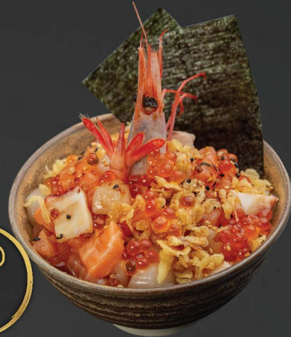
D110 BARA CHIRASHI DON $16.90 Soy marinade sashimi cubes & sweet shrimp on furikake sushi rice