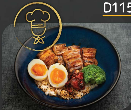
BUTA KAKUNI DON $13.90 Braised pork with in-house Soy Blend on furikake rice