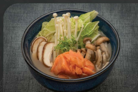
SAKE YASAI MISOSHIRU $8.90 Salmon with mix vegetables miso soup