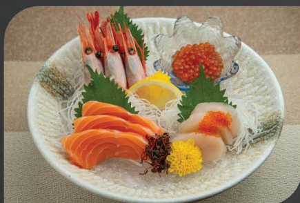
HIMIWARI SASHIMI MORIWASE $23.90 4 kinds - Salmon, raw scallop, sweet shrimp, salmon roe