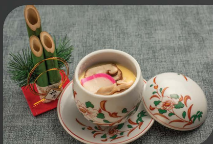
CHAWAMUSHI $3.50 Steamed egg with chicken, crabmeat, fishcake & mushroom