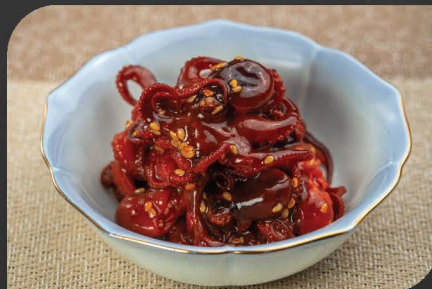
Z06 CHUKA IIDAKO $6.90 Baby Octopus