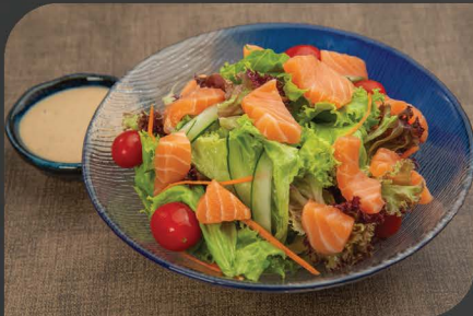
SAKE SARADA $11.50 Raw salmon cubes salad