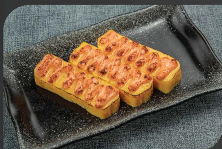
TAMAGO MENTAIYAKI $5.90 Flame seared pollock roe mayonnaise on Japanese omelette