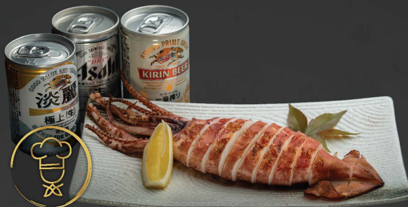
Y80 IKA SHIOYAKI/TERIYAKI Grilled Squid (Salted/Glazed)