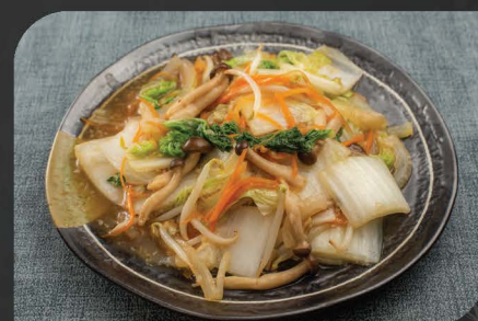
YASAI ITAME $7.90 Stir-fried Vegetables