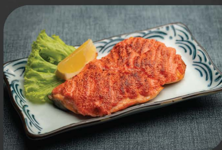
SAKE MENTAI MAYO/MISO MAYO $12.90 Grilled Salmon with flame seared pollock roe mayonnaise, miso mayonnaise