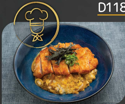
D118 KURI BUTA/TORI KATSU DON $14.90/$10.90 Deep-fried, panko breaded cutlet with sweet-soy egg sauce on rice