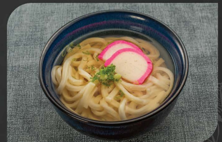
N147 SU UDON $6.50 Thick wheat flour noodles