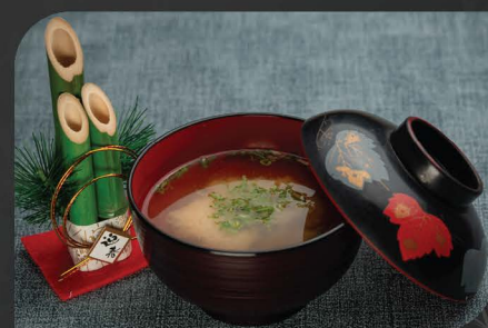
MISOSHIRU $2.90 Fermented soybean paste soup