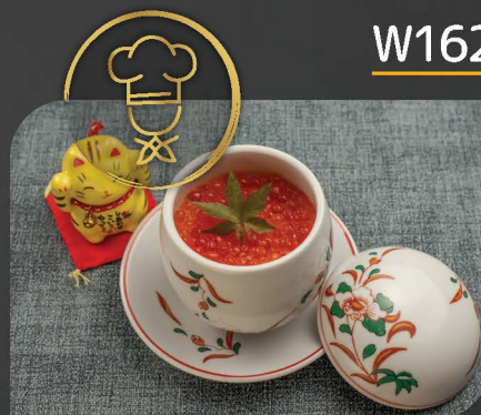
IKURA CHAWAMUSHI $6.50 Salmon roe on steamed egg with chicken, crabmeat, fishcake & mushroom