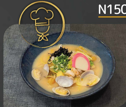
N150 KAISEI RAMEN $15.90 Seafood Ramen Choice of soup base: Pork Base/Spicy Base