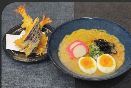
N151 TEMPURA RAMEN $13.90 Crispy batter fried prawns & vegetables with Ramen Choice of soup base: Pork Base/Spicy Base