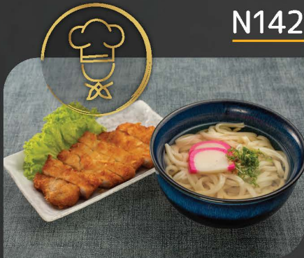
N142 KURI BUTA/TORI KATSU UDON $15.90/$12.90 Deep-fried Chestnut Pork/Chicken cutlet with hot soup noodles