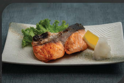
SAKE SHIO/TERIYAKI $10.90 Grilled Salmon Fillet (Salted/Glazed)