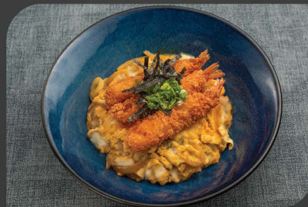
D119 EBI TAMAGO DON $9.90 Deep-fried, panko breaded prawns with sweet-soy egg sauce on rice