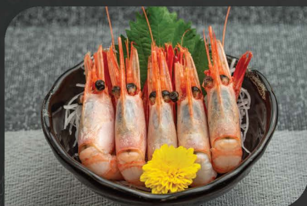
AMAEBI SASHIMI Raw sweet shrimp