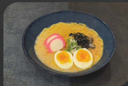
N152 SU RAMEN $8.50 *Plain Ramen Choice of soup base: Pork Base/Spicy Base