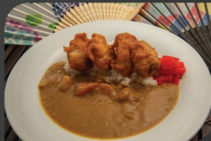
TORI KARA-AGE KARE $10.90 Deep-fried chicken chunks with curry rice