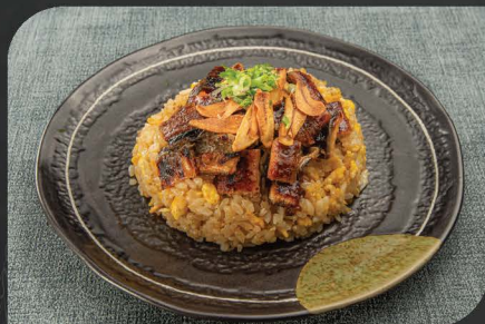
D121 UNAGI CHAHAN $13.50 Fried garlic rice with unagi slices